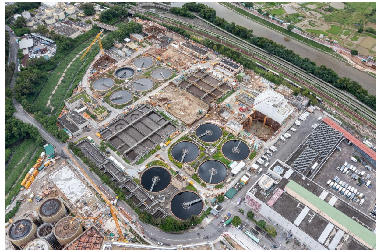
Description: Aerial Photo No. 1 in Portion A & Portion B on 19 August 2022