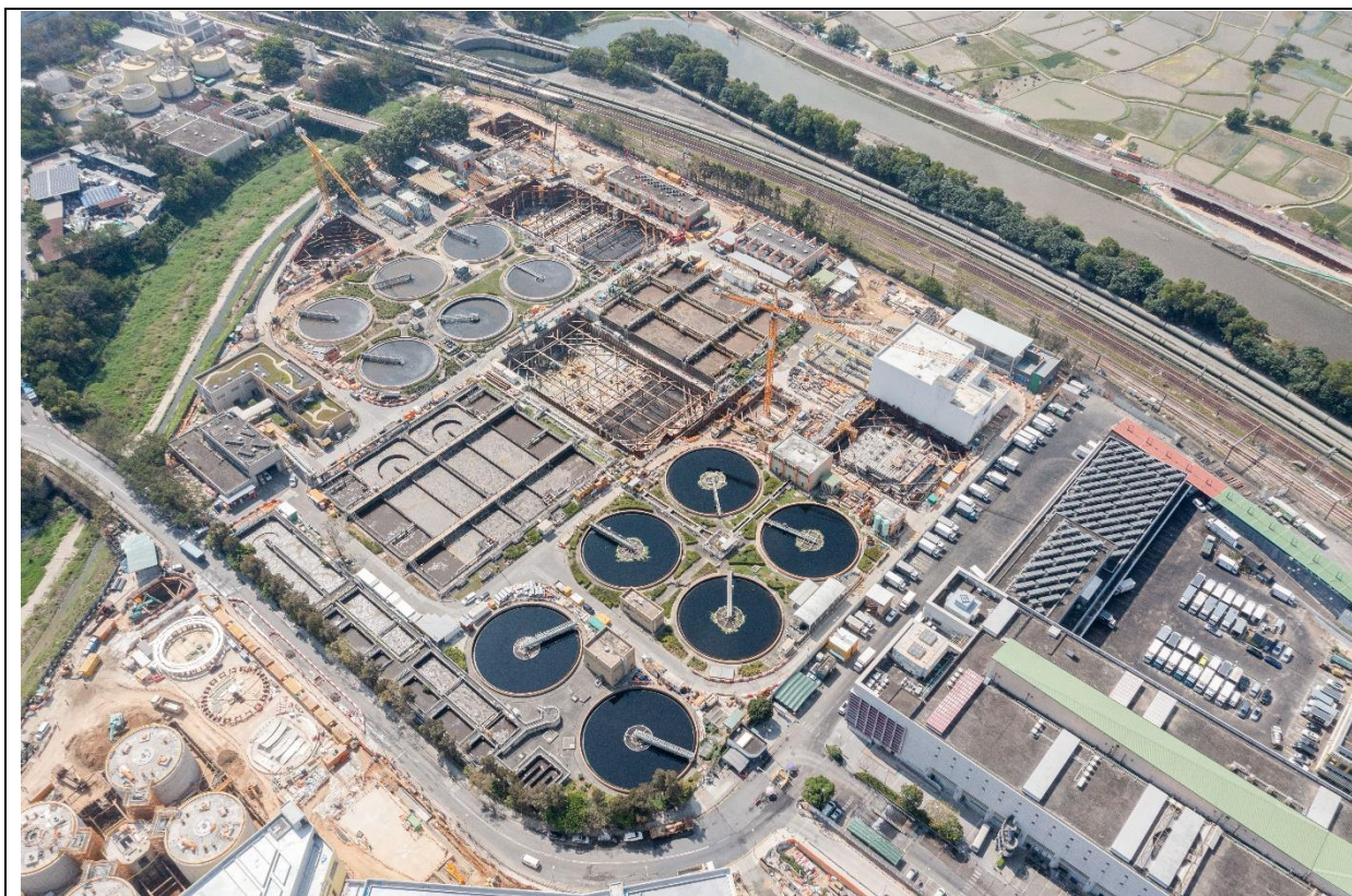
Description: Aerial Photo No. 1 in Portion A & Portion B on 16 February 2023